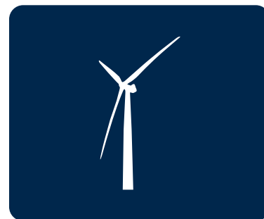
Energy & Utilities