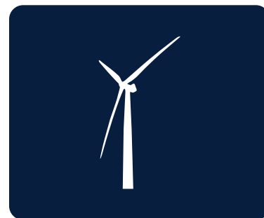
Energy & Utilities