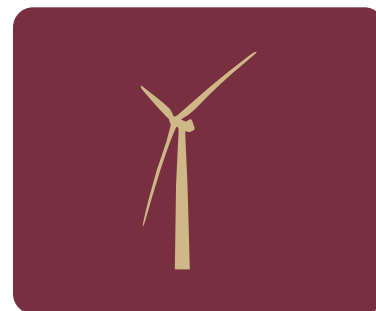
Energy & Utilities