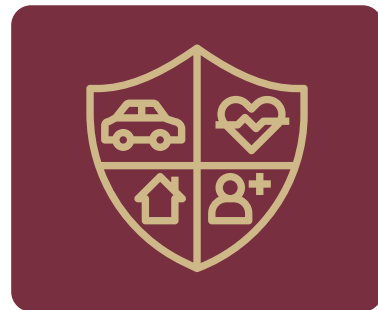
Healthcare & Insurance