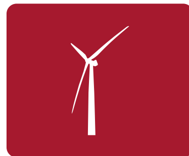
Energy & Utilities