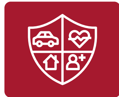
Healthcare & Insurance