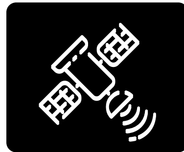
Aerospace & Satellite