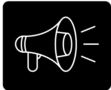
Advertising & Marketing

AWS Professionals power innovation within industries across the globe.