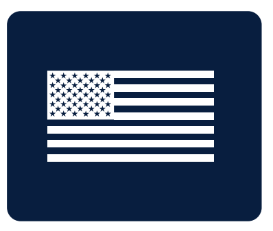
Government & Federal Agencies

CompTIA Professionals power innovation within industries across the globe.