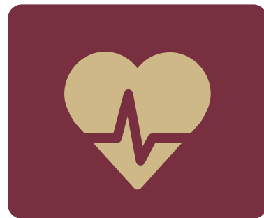
Hospitals and Health Care