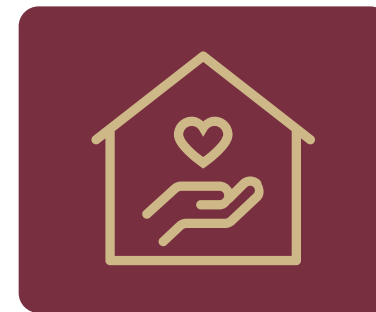
Nonprofit Organization Management