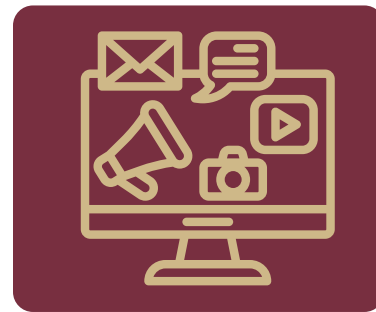
Marketing and Advertising