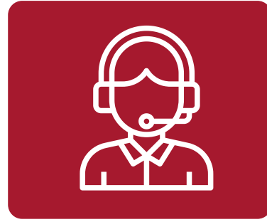
Information Technology and Services