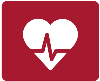
Hospitals and Health Care