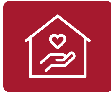
Nonprofit Organization Management