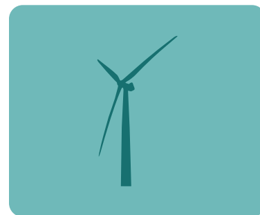
Energy & Utilities